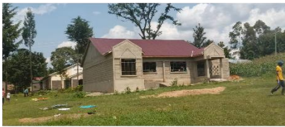
Special School for the Deaf new dormitory

2 x 5,000ltr rainwater harvesting tanks capturing water from the new dormitory roof