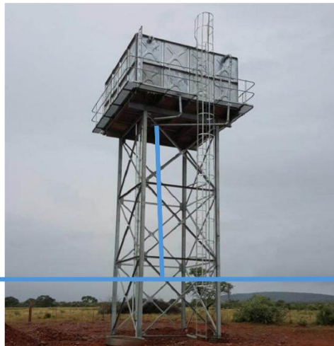
Borehole, pump and 50,000 ltr galvanised steel tank and 9mtr tower

10,000 ltr water storage tanks at each of the three institutions all fed from the central borehole water tank