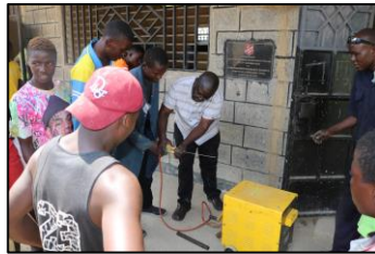
Picture above shows one of the workshop classroom blocks and demonstration of the new welding equipment purchased by the trust.