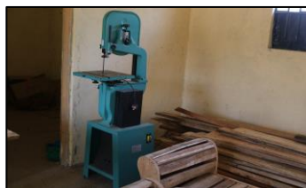
Picture above shows the new sewing machine for the tailoring course and band saw in the woodwork shop.