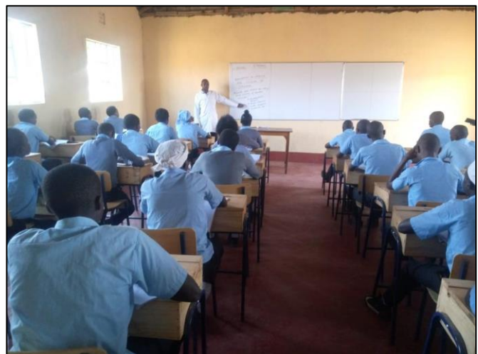
New equipped classroom at the secondary school

The Primary School has 444 students, 223 boys and 221 girls. The school was established in 1961 and is staffed by the Ministry of Education. Primary education is free in Kenya, income is very low for maintenance and building works to improve the state of the school infrastructure.