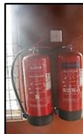
Supply of Fire Extinguishers and upgrade of water supply