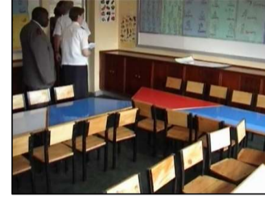
New tables and chairs