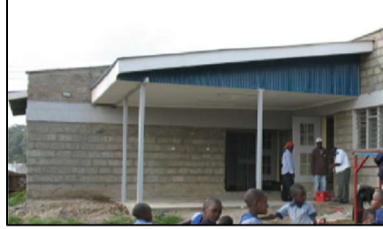
Kibera nursery school new classrooms and furniture