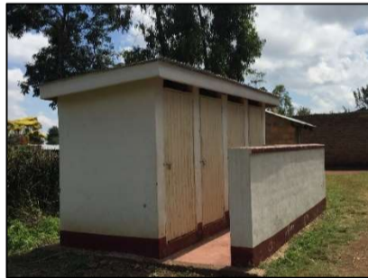
From this to -----this