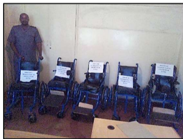
15 new wheelchairs provided at Joyland

The Salvation Army in Kenya is sometimes the only provider of specialist education for those children who would otherwise be left on the margins of society. Many of these schools are boarding schools as the children can come from towns and villages many miles away from the school.