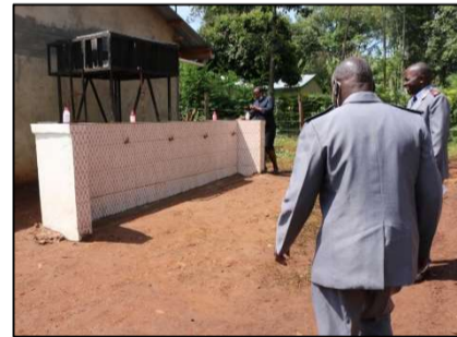
Hand washing station at a primary school