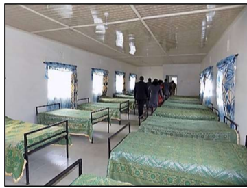
Njoro dormitory refurbished