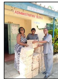
Braille paper for both Likoni and Kibos schools for the blind and visually impaired.