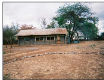
Old and new dormitory built at Gateji