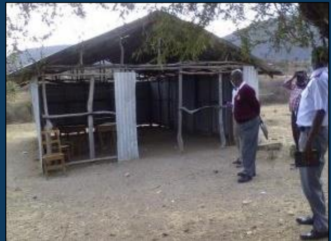
Secondary school classroom that will be replaced by two new classrooms.