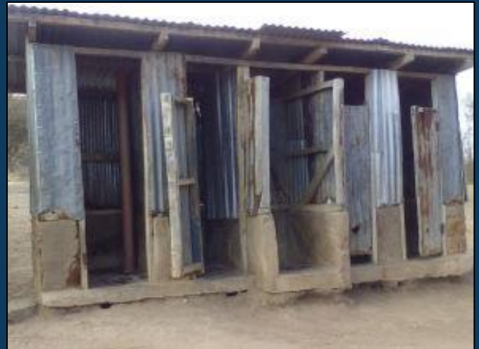
One of two existing latrine blocks serving 475 pupils. Two blocks of 8 latrines each will be built.

Our promise to you is this – 100% of your donation goes directly to the projects the trust undertakes. All the trustees are volunteers and give of their time and energies free of cost. Any administration costs are met by the trustees and the running costs of the trust are minimal.