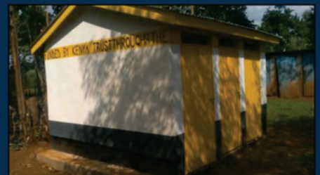
One of the two new latrine blocks