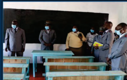
New desks in the classroom

See the full project information on the website: https://www.thekenyatrust.org.uk/wp-content/uploads/2021/07/Project-Data-Sheet-Makhwabuye-Pri-School-Rev.-5.pdf