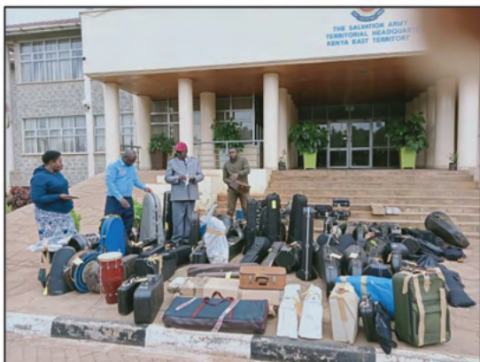
Instruments arrived and unloaded at Territorial Headquarters in Nairobi.

In July of this year a consignment of 137 instruments was sent to Nairobi. These instruments are destined for Salvation Army churches in both Kenya East and Kenya West territories to enhance and strengthen music ministry in these areas.