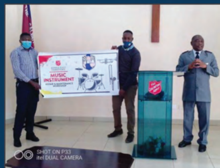
Launch of the repair shop.

Employing 2 technicians, the repair facility has already started working, on a commercial basis, to repair and maintain brass instruments.