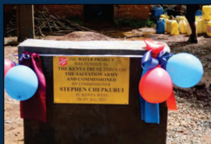
Borehole and water supply plaque.