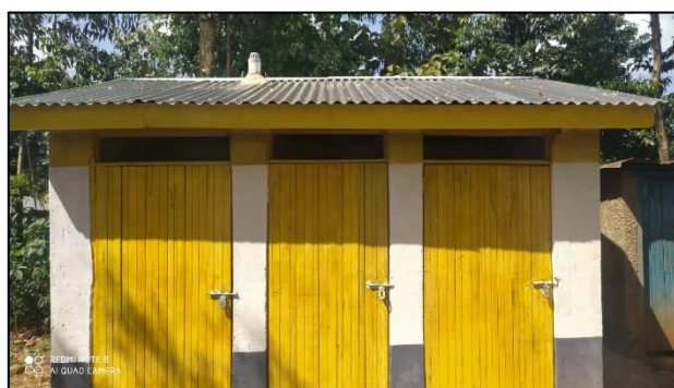
New pit latrine block completed.

Progress Report May 2021: A grant of £2,500, provided by St. James' Place Charitable Foundation, allowed The Kenya Trust to fund the building of a 6 cubicle pit latrine in a back to back configuration for the girls and this is nearing completion.