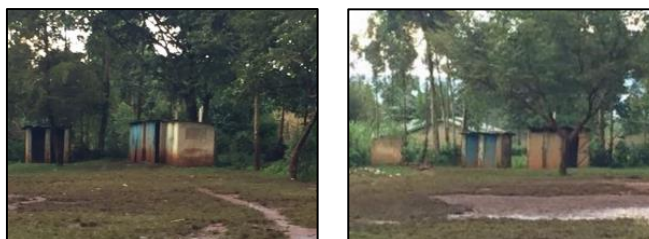
Existing latrines are not fit for purpose

Two blocks of 6 latrines were needing to be built – 1 for girls and 1 for boys.