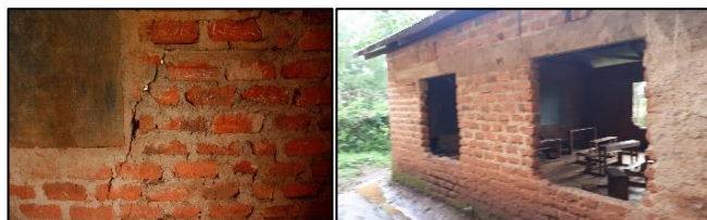
Cracks in the wall and unfinished construction

1. Classroom Rebuild: One classroom had been condemned by the authorities and no classes could be conducted in it. It was unsafe and needed either major remedial repairs or a complete rebuild. It had remained unfinished for about 10 years.