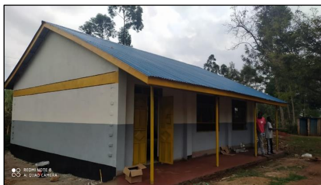
Classroom nearly complete – April 2021

2. Sanitation: There is no running water anywhere on the site. Sanitation is based on pit latrines being dug and the existing ones needed to be replaced.