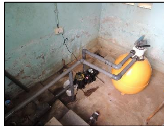
Swimming pool repair and maintenance

15 Wheelchairs were requested at a cost of £250 each, the money was raised in just over 8 weeks over the summer of 2019! Picture on the right shows the Chaplain of the school with 5 of the new chairs.