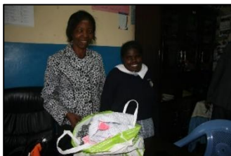
Head teacher and one of the pupils