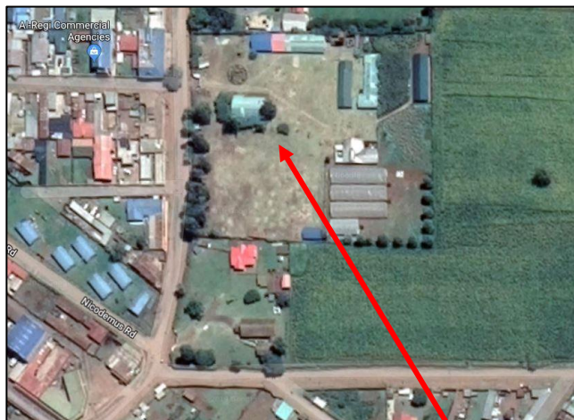
Njoro Salvation Army church. Njoro Special Needs School