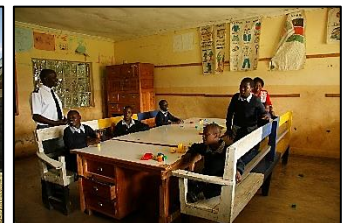
One of a number of classrooms

For more information on current projects please email us at info@thekenyatrust.org.uk .