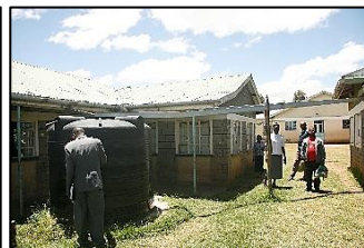
Rainwater tank from dormitory roofs