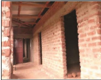
The partially completed clinic:

The project was to complete the building of a medical centre at Maiani, a rural area where the lack of medical facilities produces hardship and difficulties for over 1,200 villagers living in the vicinity, not to mention the loss of unnecessary life due to the unavailability of prompt health care. It currently takes the villagers some 20 hours to travel to the nearest centre for treatment and that is for those who are able and can make the journey. The community itself began to build the medical centre in 2011 but two dry seasons resulted in very poor harvests limiting the availability of funds. The situation called for external financial support to make progress possible and the projects manager in Kenya alerted The Kenya Trust to this opportunity and asked for our help. The attempt by the community to help themselves with very few resources itself deserved our support and providing the capability to locally treat diseases such as malaria and AIDS/HIV, and the provision of maternity facilities for the community, was of immeasurable benefit.