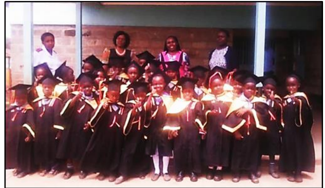
The class of 2017 graduating from Kibera Nursery School.

Pictures of the new facilities provided through funding from The Kenya Trust