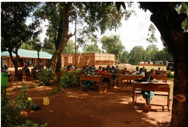
Year 8 writing their exam outside:-