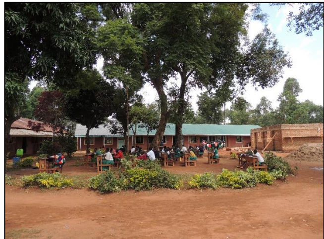
The school is a well-built school with wonderful cheerful children. There is a new classroom being built, shown on the right of the picture above and behind the group of children in the picture on the left. This is to cater for the increase in the number of students.