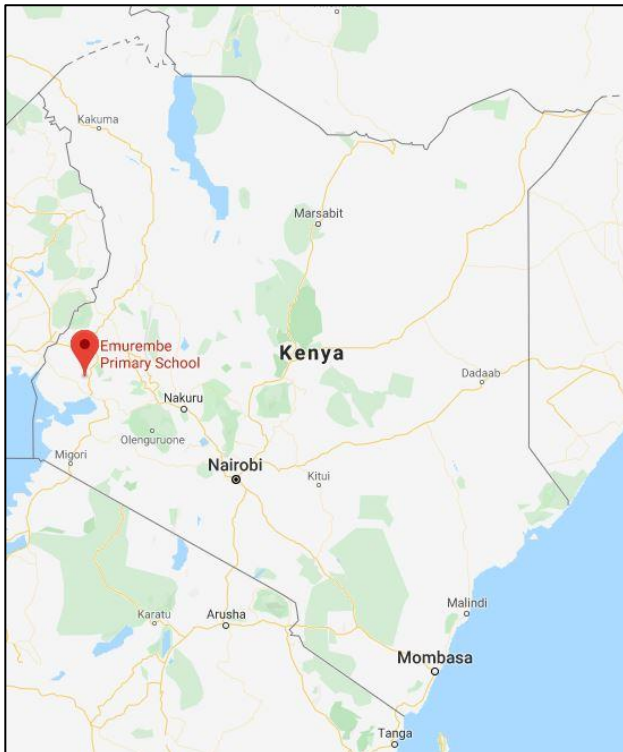
The school is located in the township of Mbitondo in Vihaga County, Western Kenya