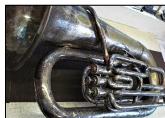
Two tubas before and after restoration. Both were with cases which made shipping much more secure.