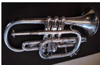
Cornet before and after restoration