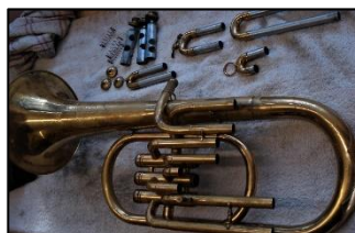
Horn before and after restoration