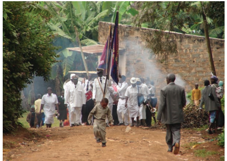
Army on the march.