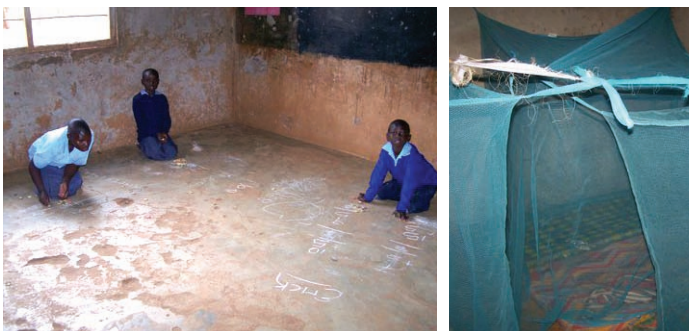
Gategi - lacking facilities