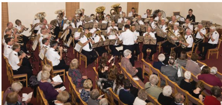
South-Western Divisional Band and Youth Chorus performing at Bristol