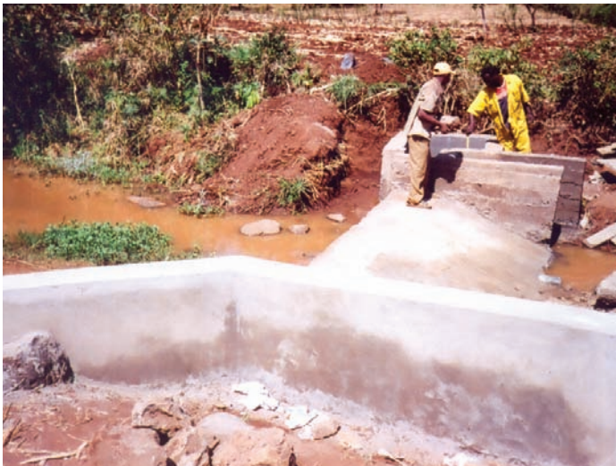
Kimirii Water Project under construction